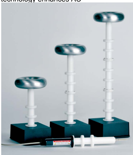
HVL Series High Performance Lab Grade, HV-SmartProbes™ shown above in 35KV, 70KV and 100KV models. Handheld HVP-35 portable HV-SmartProbes™ shown with detachable probe tip.

PX Electronics' PXe-4700 precisely measures voltages directly up to 10KV, right out of the box—with no external probes. That's high enough for most of the HV sources out there. However, should you care to expand your high voltage measurement range—just add one or more of the available 35KV, 70KV, 100KV and 150KV SmartProbes™. The PX Electronics SmartProbes™ each store their own calibration data which is down loaded when they are plugged in to the PXe-4700, this results in high accuracy, calibrated readings and allows any PX Electronics SmartProbe™ to be used with any PXe-4700 HV Meter. The SmartProbe's™ proprietary, ultra-low TC attenuator design minimizes self-heating—while its low capacitance technology enhances AC