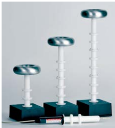
HVL Series High Performance Lab Grade, HV-SmartProbes™ shown above in 35KV, 70KV and 100KV models. Handheld HVP-35 portable HV-SmartProbes™ shown with detachable probe tip.

PX Electronics' PXe-4700 precisely measures voltages directly up to 10KV, right out of the box—with no external probes. That's high enough for most of the HV sources out there. However, should you care to expand your high voltage measurement range—just add one or more of the available 35KV, 70KV, 100KV and 150KV SmartProbes™. The PX Electronics SmartProbes™ each store their own calibration data which is down loaded when they are plugged in to the PXe-4700, this results in high accuracy, calibrated readings and allows any PX Electronics SmartProbe™ to be used with any PXe-4700 HV Meter. The SmartProbe's™ proprietary, ultra-low TC attenuator design minimizes selfheating while its low capacitance technology enhances AC performance. In addition to the direct input terminal the PXe-4700 has two probe inputs—use one