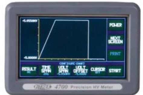
Chart Mode automatically plots voltage readings from a few seconds to several days. Highly useful for determining ramp linearity, overshoot and sag on hipot testers and other HV sources.

Automate your HV test equipment with the PXe-4700's built-in Ethernet port, high speed serial communication port or available GPIB. The PXe-4700 is fully programmable—so you can select your measurement mode and bandwidth, then take readings as often as desired. The PXe-4700 also comes standard with a USB printer port, to capture readings and get hardcopy printouts of HV plots—so you can document the sag or overshoot in a typical hipot test.